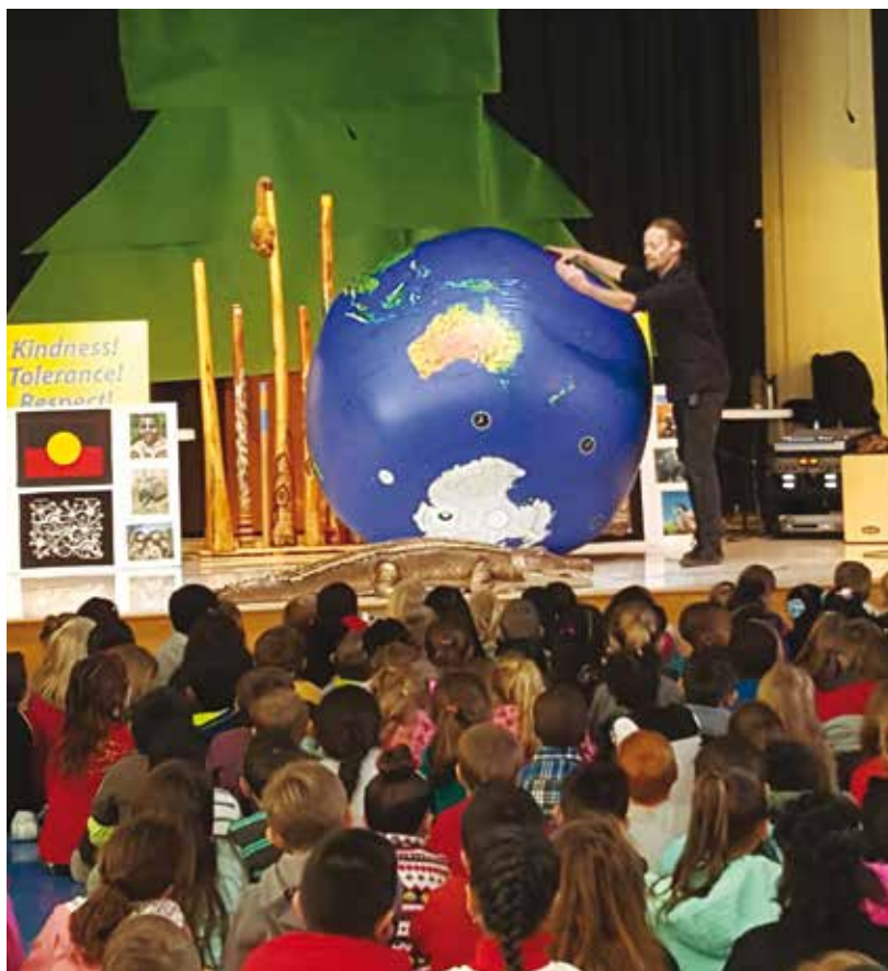
Didgeridoo Down Under is a unique fusion of Australian music, science, literacy development, comedy, character building, and more.

Reports due at the conclusion of the lesson show excitement from educators and an appreciation for yet another way to teach today's learners.